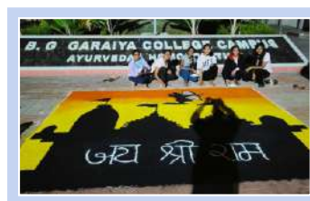
Signature Rangoli by BAMS Students