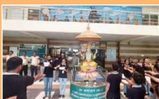
Charak Pledge by N.S.S. Unit