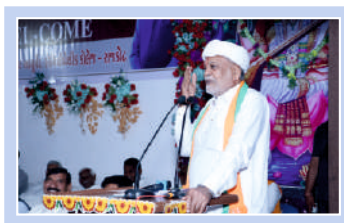
Campus visited by Shree Parshottam Rupala (MP)