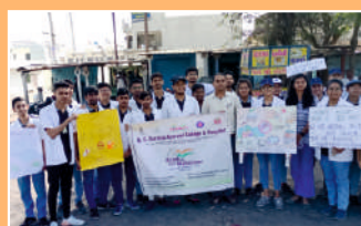
Health Awareness Rally under N.S.S. Unit