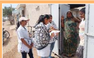
Health Awareness Survey Program