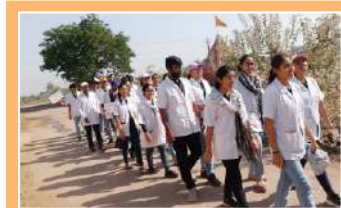
Voter's Awareness Rally