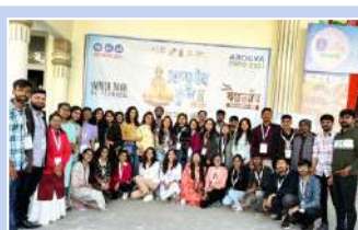
Participation in WORLD RECORD EVENT in Haridwar