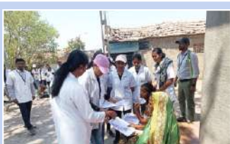
Health Awareness Program