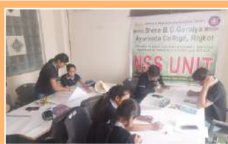
World No Smoking Day Celebration Through Poster