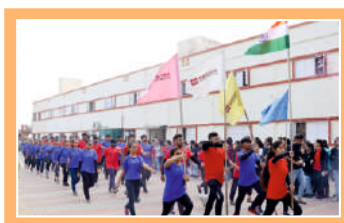
Garaiya Khel Mahakumbh