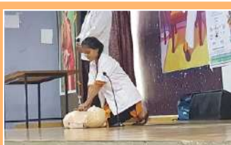
Cardiopulmonary Resuscitation Demonstration