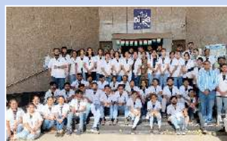
District Forensic Lab Visit