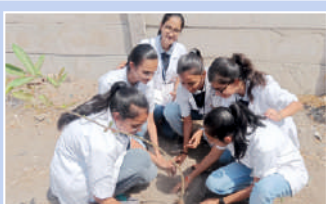
Herbal Plantation Program