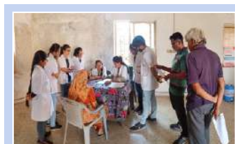
Health Diagnostic Camp on World Health Day