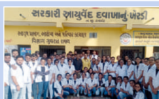
Rural Clinical Study Tour