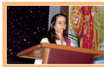
International Guest in Inauguration of Induction Program