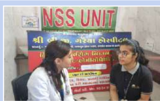
School camp on International Women's Day