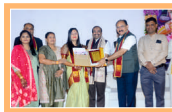
Degree Distribution Ceremony