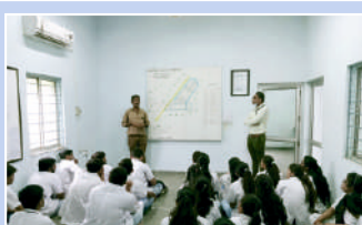
Study Tour to Water Filtration Plant