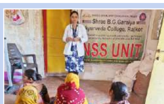
Health Awareness Program on International Women's Day