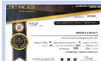
Rank in Science Olympiad