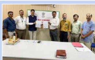
Signing MoU with Government Pharmacy College For Co-operation in Pharmacy