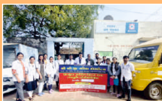
Health Diagnostic Camp