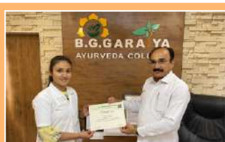
B.A.M.S. Fourth Year Topper - 2023