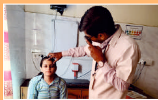
Eye Screening on World Blindness Day