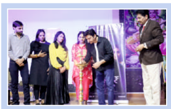
Promotional program by Bollywood celebrities