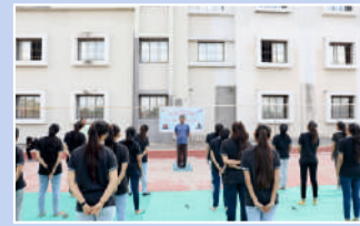
Yoga & Naturopathy Training Camp