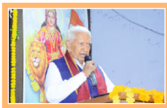
Chief Guest Hon'ble Ex. Governor Shree Vajubhai Vala Sir