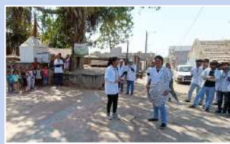
Street Play on De Addiction Campaign