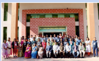
Workshop on Agadatantra