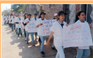
Health Awareness Rally under N.S.S. unit