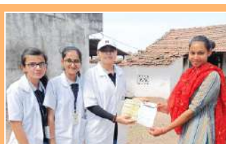
Health Awareness Campaign through Pamphlet Distribution